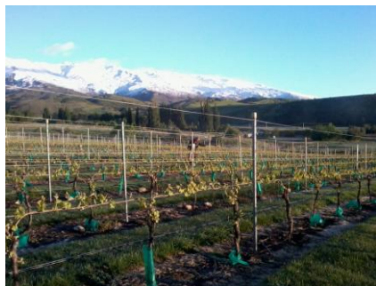
Spring morning – Lowburn Ferry vineyard